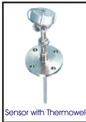
Sensor with Thermowell