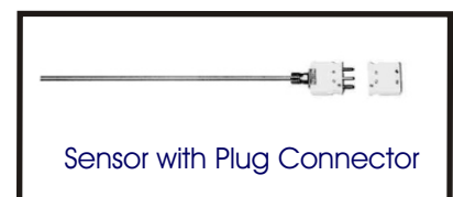
Sensor with Plug Connector

-Thermocouple assembly Fine Element Alloy as an Extended Cable.