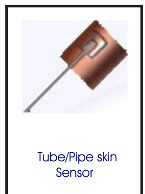
Tube/Pipe skin Sensor