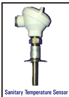
Sanitary Temperature Sensor